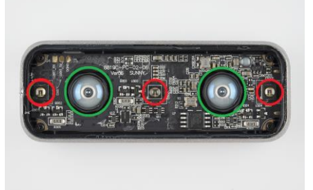
Figure 1. The 3 infra-red sensors are marked with red, while the 2 cameras are marked with green

There are very few details known about the Leap Motion Controller's inner structure and its basic operational properties [8]. One clear fact is that it uses infrared imaging for object tracking, containing two cameras and three infrared LEDs to improve lighting conditions. Figure 1 shows an image of the controller's hardware setup.