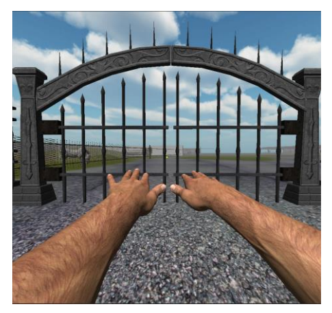
Figure 4. Single eye's view during the double outwards swipe gesture

In order to enter the zoo, two actions need to be performed. The first one represents pressing a button, for which the system responds with an audio playing that gives information about the second action needed to be performed, that is opening the doors. This is accomplished using the Double Outwards Swipe gesture (Figure 3): the hands are placed initially above the controller, with the palms parallel to it and with their thumbs touching, and then perform a swipe with each hand in opposite directions. The character has to be placed in front of the doors for them to actually open, as it would make no sense to be able to open the doors from a far distance (see Figure 4).