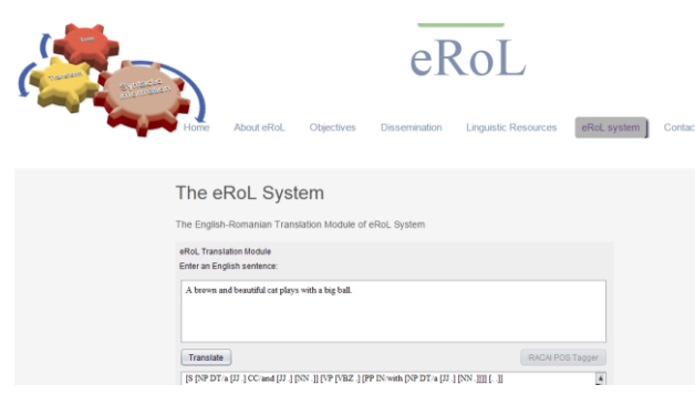
Figure 1. The eRoL System Web Interface

In what follows we will exemplify the implemented translation mechanism, by considering the following English sentence: