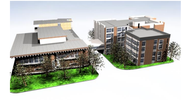
Figure 7. Render of the Faculty of Automatic Control and Computer Science buildings in 3D UPB

Since the development of Open Simulator has slowed down, the team behind 3D UPB is looking for alternatives, for example Unity 5 [8].