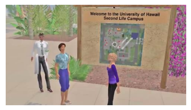
Figure 7. University of Hawaii virtual campus in Second Life.

Students have used as a social hub and as a place for 3D art exhibitions.