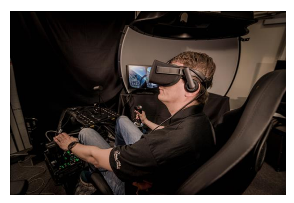
Figure 8. Student using a virtual reality flight simulator. [24]