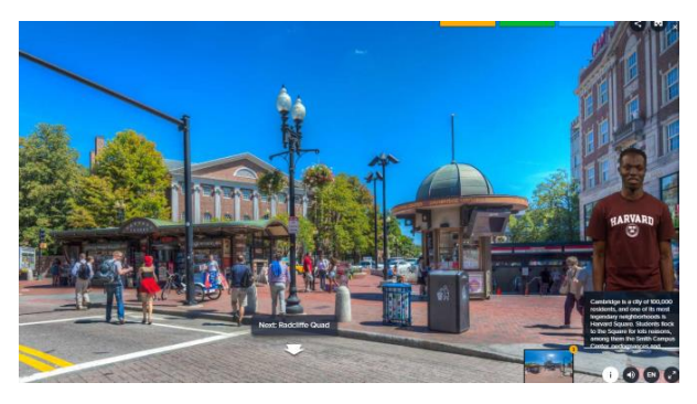
Figure 4. Harvard University virtual tour interface with "virtual tour guide" on the right side.

The experience is centered on locations and the user's current location is displayed in a small map in the bottom left corner.