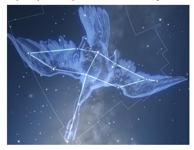
Figure 9. Star Chart application showing the Cygnus constellation [24]

Augmented reality is also used for educational purposes, as an informative overlay to the real world. A good example is the Star Chart [29] application, which shows a constellation map on top of a star system that the user is filming.