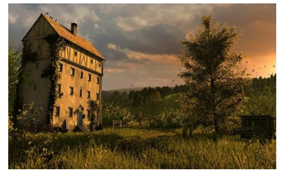
Figure 2. Rendered 3D environment [16]

Interactive 3D environments are most commonly associated with video games. They use 3D models, textures and animations to render a virtual world on the user's screen.