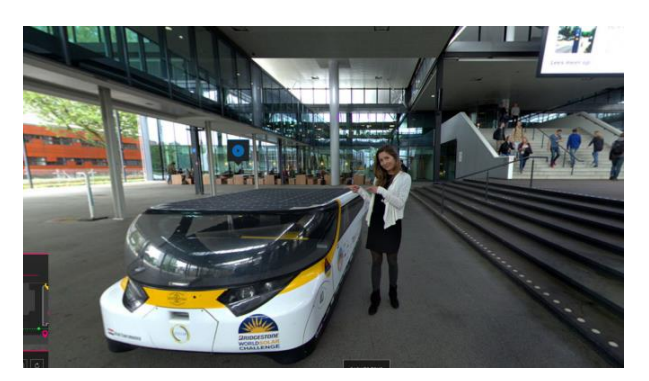
Figure 5. Eindhoven University of Technology virtual tour displaying a "virtual tour guide" (female student) integrated in the 360-degree picture. The "Play" displays a video about the presented vehicle.

Videos are used prominently throughout the tour, as the user can click on various objects representing university projects or activities and see a detailed video about them.