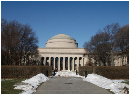
Figure 1. For images, be sure to have a good resolution image (see item D within the preparation instructions).

Use a numbered list of references at the end of the article, ordered alphabetically by first author, and referenced by numbers in brackets [2, 4, 5, 7]. Make the text of this section ragged-right, so that the increasing number of references/citations with web addresses/urls do not have large word and letter spacing. For papers from conference proceedings, include the title of the paper and an abbreviated name of the conference (e.g., for Interact 2003 proceedings, use Proc. Interact 2003 ). Do not include the location of the conference or the exact date; do include the page numbers if available. See the examples of citations at the end of this document.